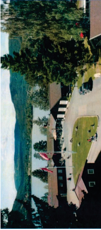
The campsite "Haraldvangen"

Rotary Norway and the Norwegian Rotary Forum (NORFO) welcome everybody to experience two exciting activity weeks in Norway. During these two weeks focus will be on communication and interaction between people from different social cultures. The days will be filled with an active outdoor life. More information about the camp and application procedures is listed on www.handicamp.no