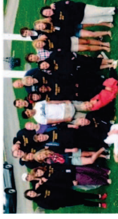
Activity leaders Handicamp 2010

Closing date for submitting applications is 1 February 2014. Candidates for participating in Handicamp Norway 2014 are requested to register their application to secretary@handicamp.no as soon as possible.